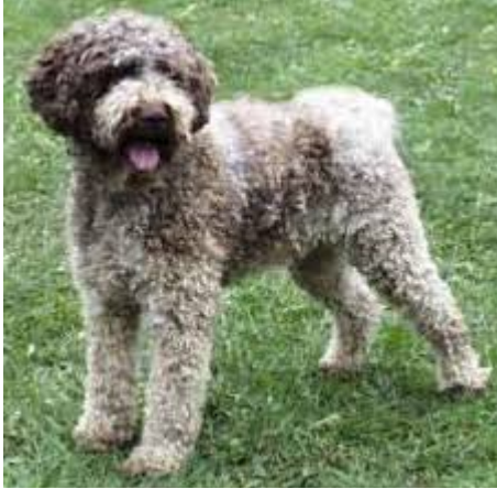
A Lagotto Romagnolo

Lolo is an Italian breed commonly used to hunt truffles, but McGee said any dog can be trained. "It's about working with the dogs' personalities and different learning styles."